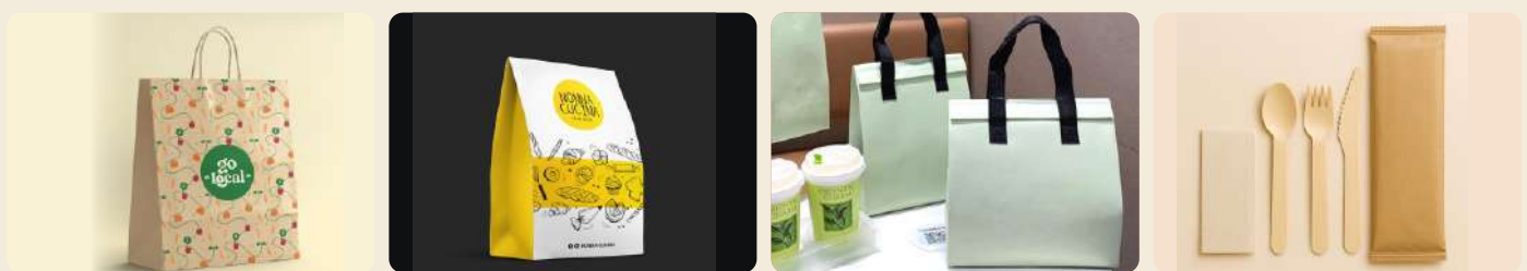
PAPER CARRY BAG